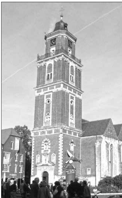
The tower of Sankt Jakobi Church