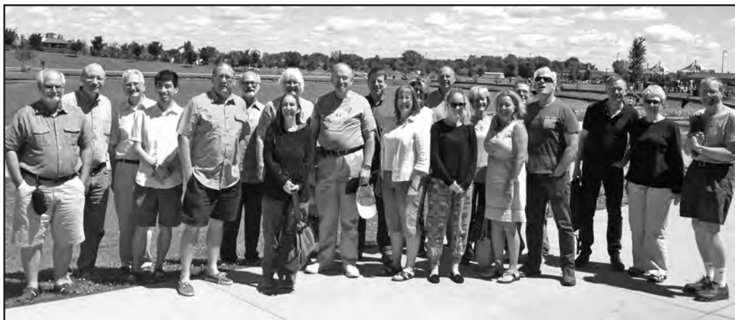
Attendees of the 2016 Springfield International Carillon Festival