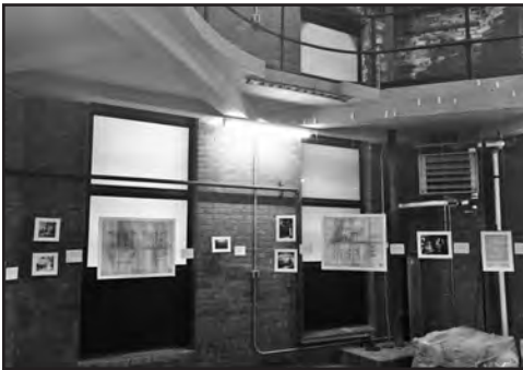
One of the projects commissioned as part of “50 for the 50th,” Harkness Tower housed a historical display of memorabilia related to the Tower and carillon entitled “Up the Spiral Staircase”