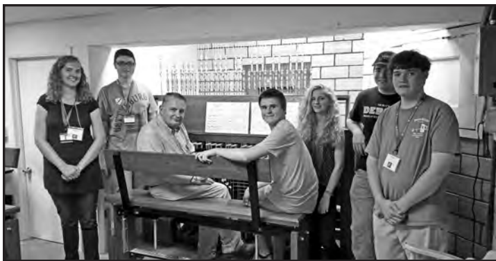
The final group of POEA participants in the playing room of the Emery Memorial Carillon

We wanted to make this little report to our colleagues in the GCNA, to encourage being aware of such opportunities in their areas. Many of us are also members of the AGO, but if not, it would be desirable to develop lines of contact with your nearby AGO chapter or chapters, and let them know of your interest in providing an introduction to the carillon to visiting students, should they plan a POE or POEA in the future.