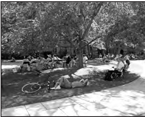
Listening to the New Music Recital

and dedicated to the Yale students who fought in World War I.