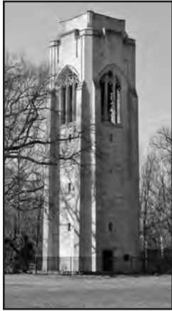
The Mary M. Emery Memorial Carillon