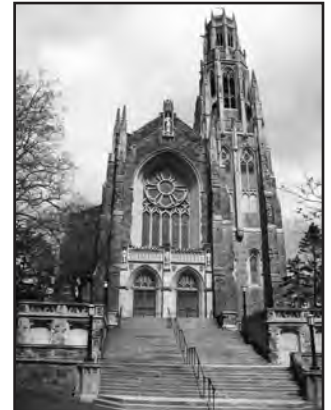
The Cathedral of Christ the King

The Cathedral is now able to ring Mass calls, peals, and tolls. The renovation was completed just before Easter 2015. The Cathedral is in the process of doing exterior renovations to the stonework of the Cathedral and the roof.