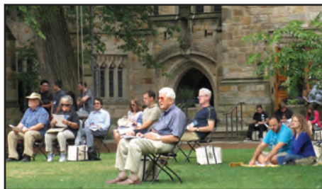
A captive audience in Branford Courtyard

the Opening Dinner held at the Cask Republic restaurant.