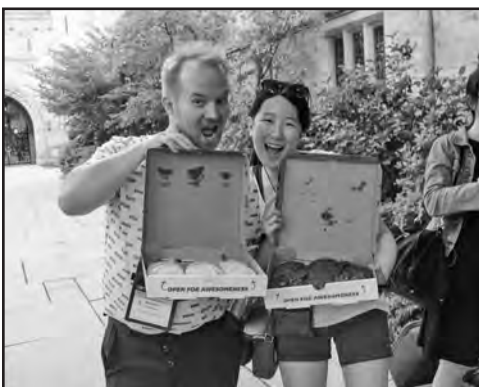
Cookies! Get ‘em while they’re hot!

We met Monday morning for the closing business meeting. After open tower time when the carillon rang with individual carillonneurs playing, many of us gathered together to savor a delicious brunch buffet at the Graduate Club.