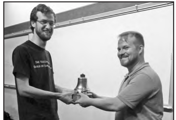
Passing of the bell