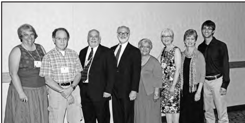
GCNA Board of Directors

For the post-Congress session, a few attendees remained Friday evening for the box supper and the musical Leap of Faith , one of the productions in MSU's 2015 Tent Theater season. The box dinner was served indoors – but the production was staged under a large tent. Those who attended had excellent seats – center in the third row from the front! Talented young actors made the production a success.