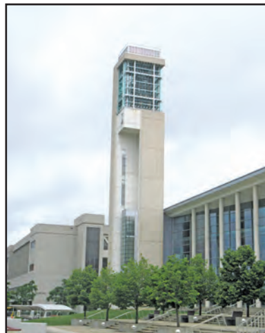
Jane A. Meyer Carillon