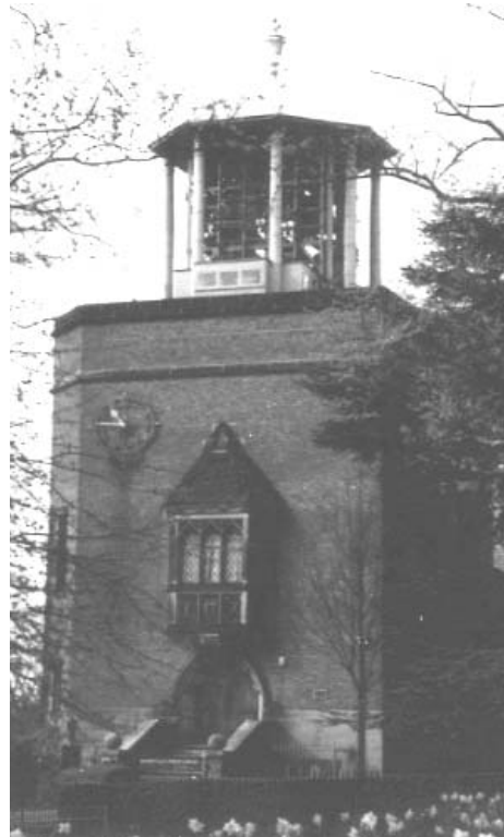
Bournville Carillon, site of the 2006 Eurocarillon Festival

Concerts featuring music from the carillonneurs' countries of residence and of Mozart to mark the 250th anniversary of his birth were given on the two traveling carillons in downtown Birmingham,