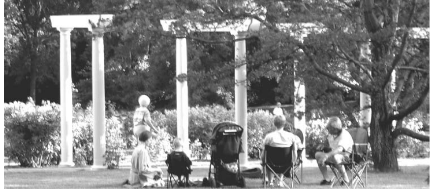
Rose Garden at Washington Park, Springfield, Illinois