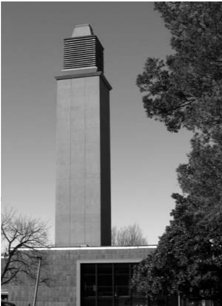
Vann Tower at the Belgian Friendship Building of Virginia Union University

The carillon in Hoover Tower, part of the Hoover Institution on War, Revolution and Peace at Stanford University in California, is well known.