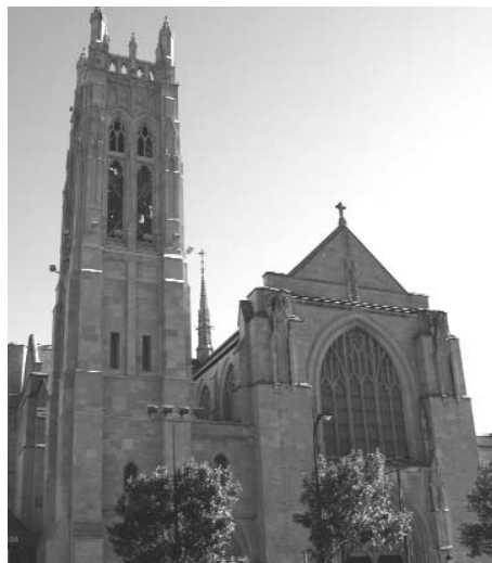
Central Lutheran Church, Minneapolis

At the conclusion of the concert, other church bells in downtown Minneapolis joined in a collective peal of celebration.