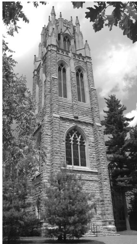
Shapard Tower at The University of the South, Sewanee, Tennessee

As people around here say, "Welcome to Sewanee."