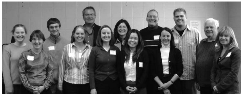
Participants at the Iowa State University Carillon Festival