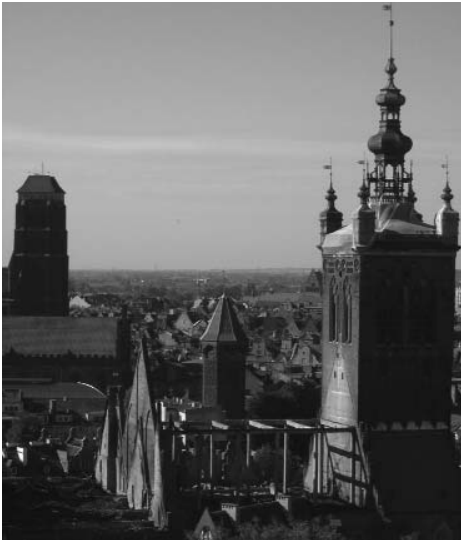
St. Catherine's Church, gutted by fire

body of St. Catherine's Church was gutted by fire in the month preceding the WCF Congress. Fortunately, the tower was almost untouched by the fire, and the carillon was unaffected.