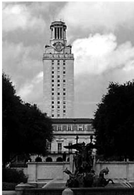
Carillonneurs for the 2007 International Festival at Historic Bok Sanctuary