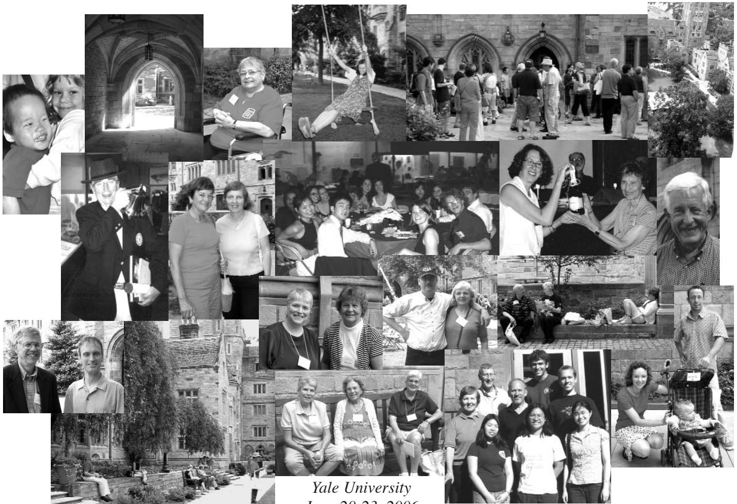
Yale University June 20-23, 2006