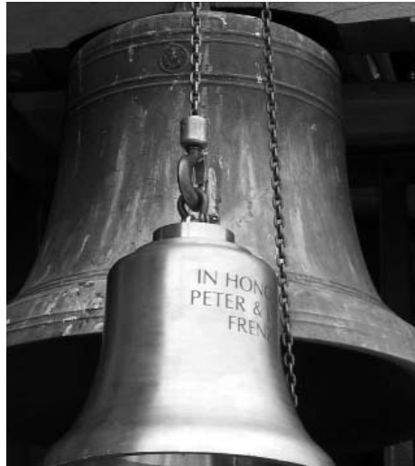
A new bell hoisted into Wesleyan University's Carillon