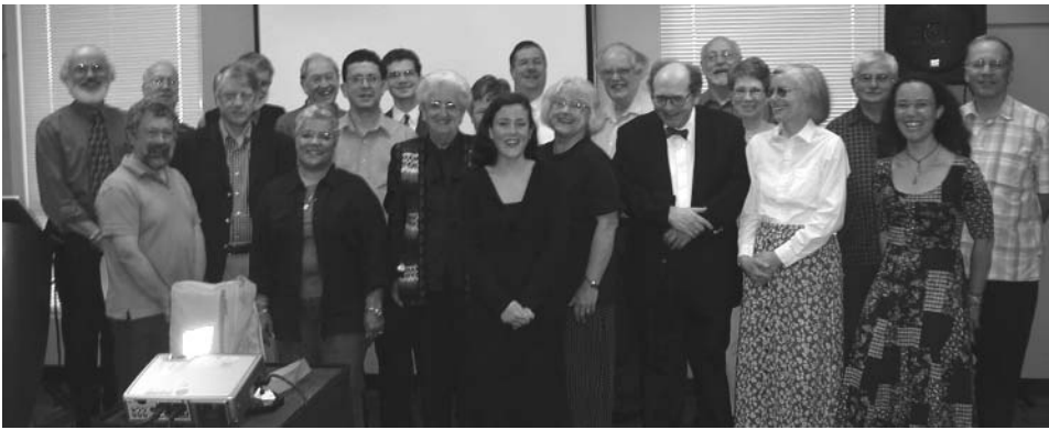
Midwest Regional attendees

project upon initial approval of the plan and its completion. The four main categories into which the chart was divided were the tower, the carillon, assembly, and maintenance. Interesting features of the installation include an apartment for visiting artists, a floor dedicated to educational and office space, a screening room with exhibits about the carillon, and a parlor (with bar) for receptions. Mr. Elias' presentation demonstrated the care and precision with which the Alverca carillon project was undertaken and provides a useful template for future carillon projects.