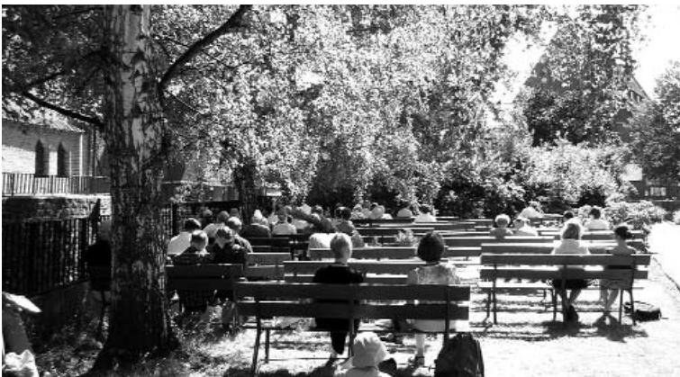
Listening area beside St. Catherine's Church