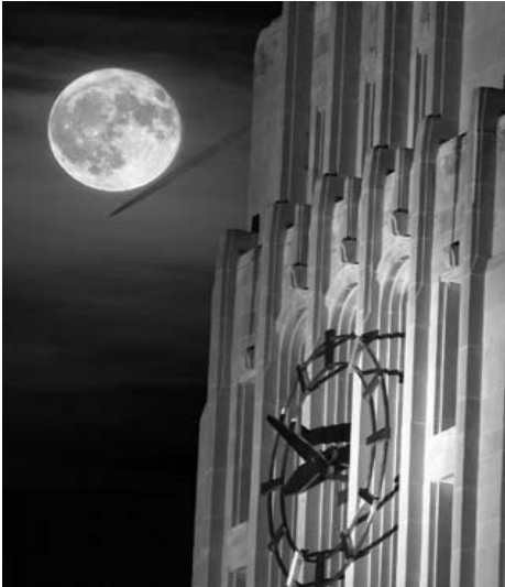
Burton Tower, University of Michigan