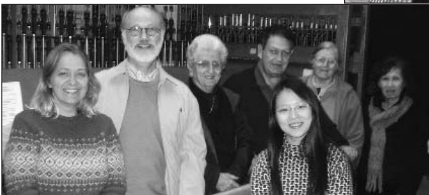
At left, University of Sydney carillonneurs