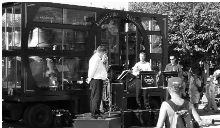
Eijsbouts traveling carillon at Sopot, Poland