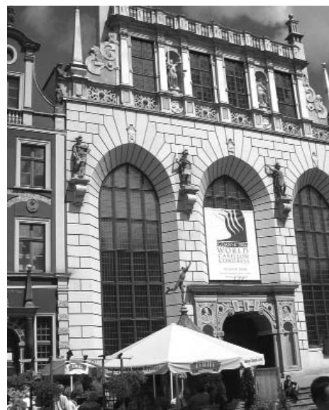
Artus Court, Gdansk, Poland