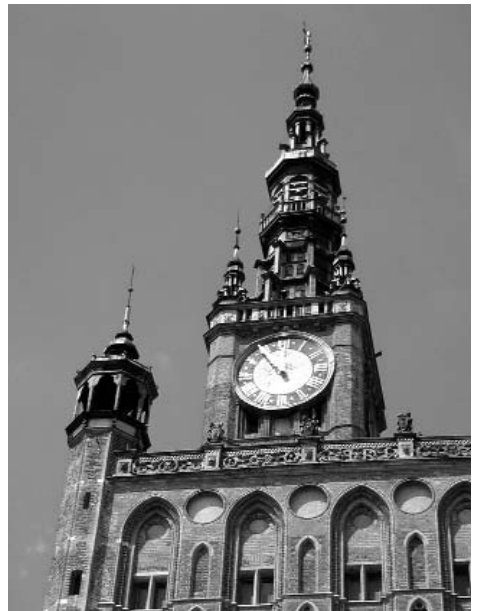
Town Hall, Gdansk